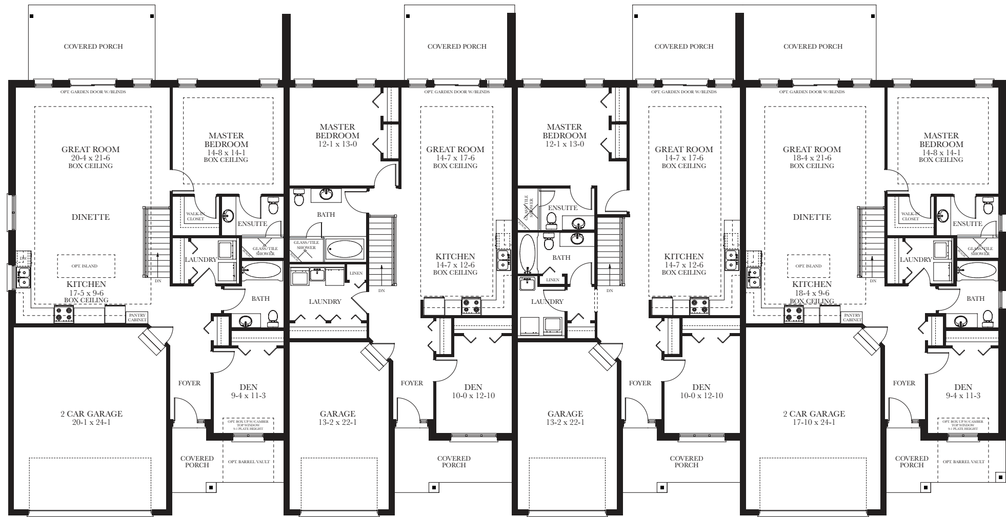
THE WATERLOO MAIN FLOOR PLAN 1,419 SQ.FT.